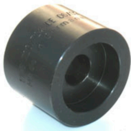
The BMW coolant seal installation mandrel. Outer diameter 40mm Step diameter 28mm Inner diameter 12mm Step depth 8mm