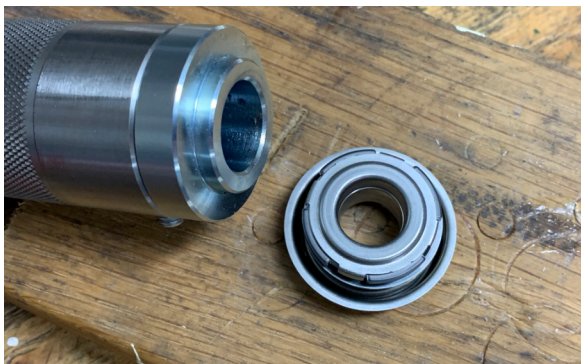
Your tool with new seal