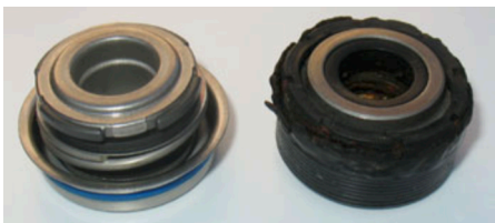
New seal - Old seal